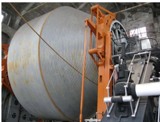
Quincy Steam Hoist, Calumet, MI Datolite Crystals...South Africa