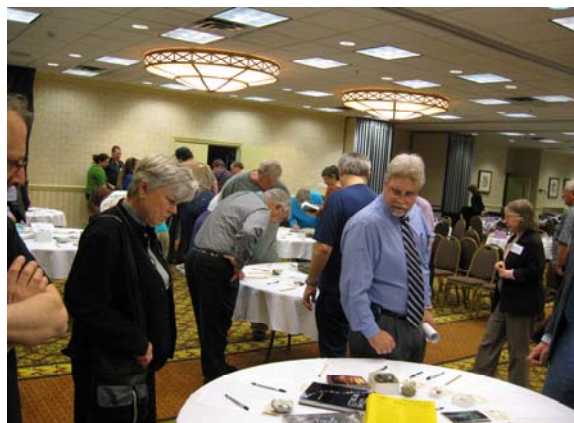
Rochester Symposium Auction