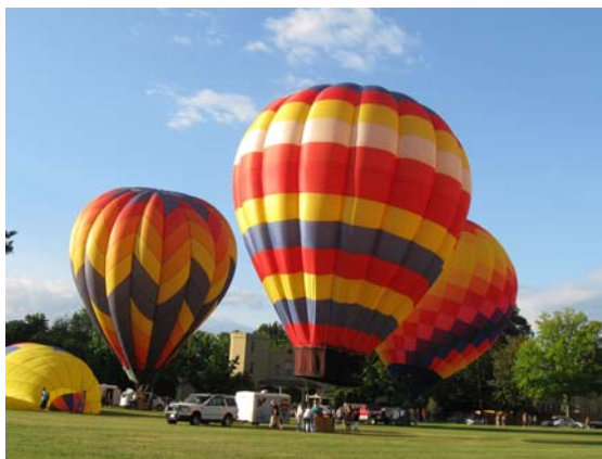
Color on July 4, Lexington, VA