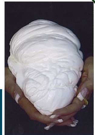
Lao Tzu - largest known pearl

surface, albeit very rarely. For instance, the Pearl of Lao Tzu is the largest known pearl in the world 5 . It is a clam pearl or "Tridacna pearl."