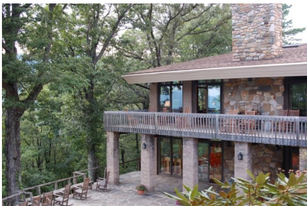
Wildacres Retreat, located on a mountain near the Blue Ridge Parkway in Little Switzerland, NC.

For details and reservations, call 828-756-4573 or send an e-mail to wildacres@wildacres.org . ↗