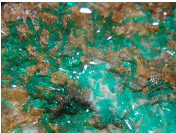
Diopside from Harquahala Mine, La Paz Co., AZ.

capture. Sometimes, the colors seem to be off or washed out.