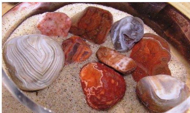
Lake Superior agates.

In case you missed it, check out the January 2013 newsletter. It features several articles about Wayne and about agates.